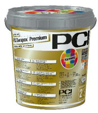
PCI Durapox® Premium Harmony - the new color-neutral epoxy resin joint grout especially for grouting glass mosaic (link to high-resolution <u>Photo</u>)