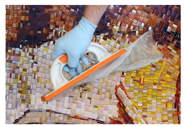
Easy processing of PCI Durapox® Premium Harmony. (Link to the high resolution Photo)