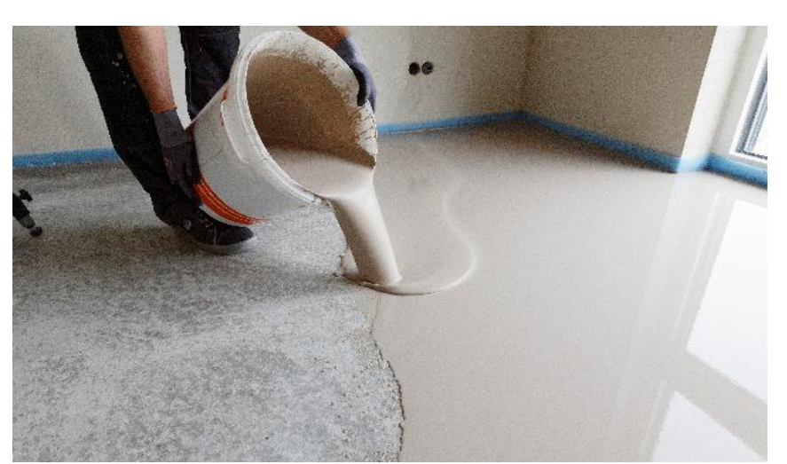
The new PCI Periplan Flow leveling compound with exceptional flow properties (Link to high-resolution Photo)