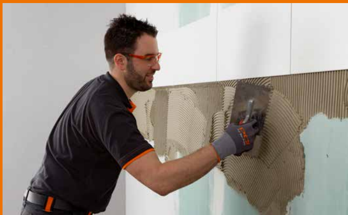
The lightweight fillers make application easier and smoother than ever before.

Even large-format, heavy tiles can be effortlessly fixed to the wall without slipping and corrected in a relaxed manner up to approx. 15 minutes after laying. PCI Nanolight is the multi-purpose star in the PCI universe. One for all substrates and all ceramic coverings.