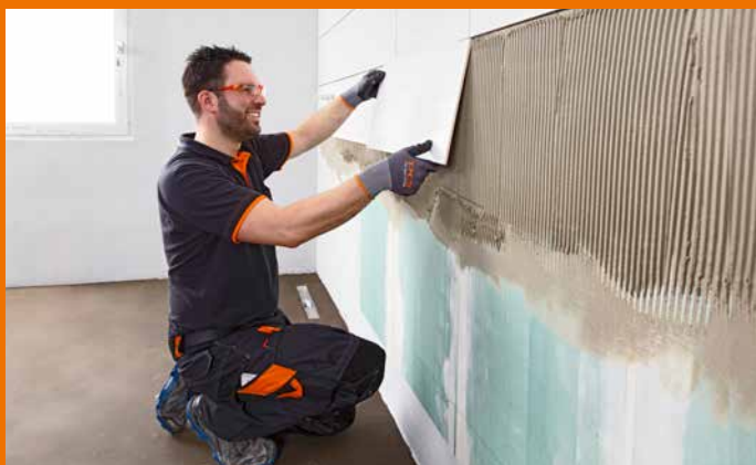
Very relaxing and effort-saving tiling.